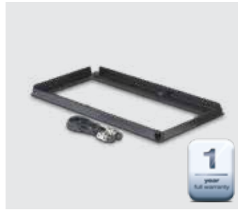
DOMETIC COOL-POWER RAPS72 KIT Battery cradle

Dimensions (W x H x D) mm: 100 x 77 x 54 Weight: 0.3 kg Ref No. 9108400100