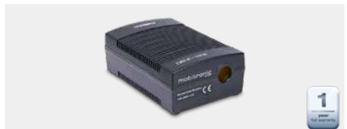
DOMETIC COOLPOWER EPS-817 Power adapter

Dimensions (W x H x D) mm: 120 x 70 x 200 Weight: 1 kg Ref No. 9109002476