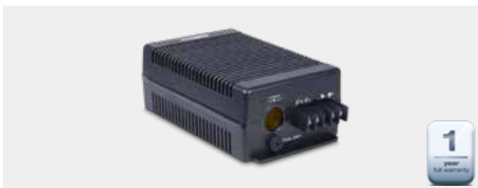
DOMETIC COOLPOWER MPS-50 Power adapter