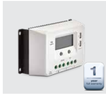
DOMETIC SC1230 30 A Solar charge controller

Dimensions (W x H x D) mm: 232 x 215 x 450 Weight: 1.04 kg Ref No. 9105303701