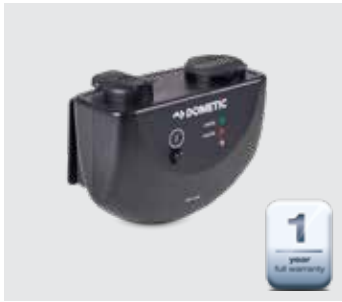
DOMETIC COOL-POWER RAPS12R-U2 Fridge power kit